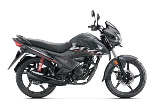
MATTE AXIS GREY METALLIC